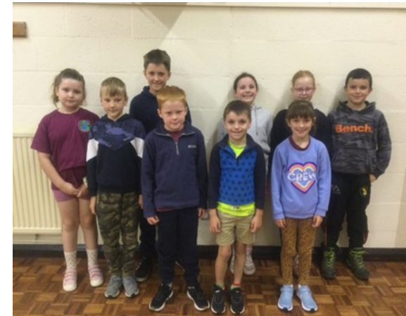
‘Clwb Eco’ 2022-23

Equal opportunities are provided for all pupils with disabilities at all times. Appropriate arrangements will be made on entry to meet individual requirements.